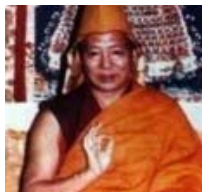
Kyabje Zemey Rinpoche