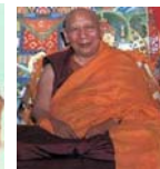
Kyabje Yongdzin Ling Rinpoche (1903 - 1983). Before fleeing Tibet in 1959, he had been appointed as His Holiness the Dalai Lama's Senior Tutor and became the 97th Gaden Throne Holder in 1965