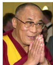
HH Dalai Lama XIV