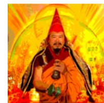
HH Dromptug Rinpoche