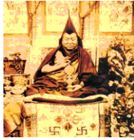
Kyabje Pabongka Rinpoche