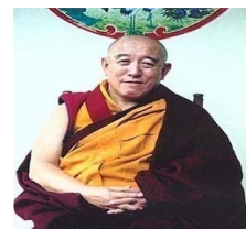
Kyabje Denma Locho Rinpoche