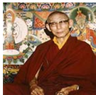
Kyabje Trijang Rinpoche