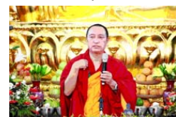
HH Kadham Trichen Rinpoche