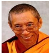
Geshe Kelsang Gyatso