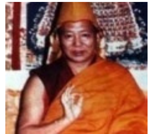
Kyabje Zemey Rinpoche