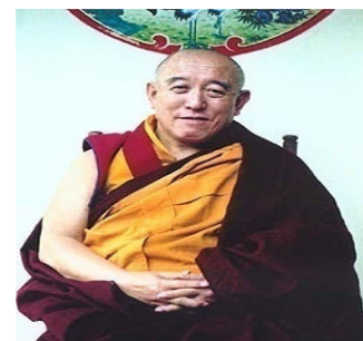
Kyabje Denma Locho Rinpoche