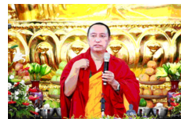
HH Kadham Trichen Rinpoche