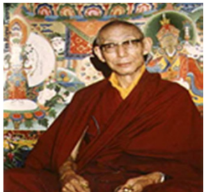
Kyabje Trijang Rinpoche

Kyabje Pabongka Rinpoche (1878 - 1941AD)