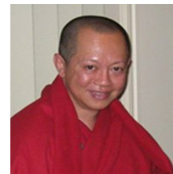
HE Gontug Rinpoche