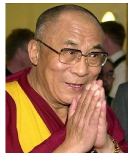
HH Dalai Lama XIV