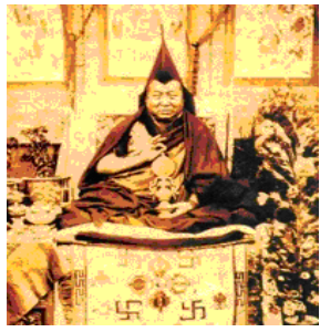
Kyabje Pabongka Rinpoche

The Kadampa tradition founded by Atisha was the direct source of inspiration for the development of the Gelugpa tradition founded by Je Tsong Khapa (1357-1419).