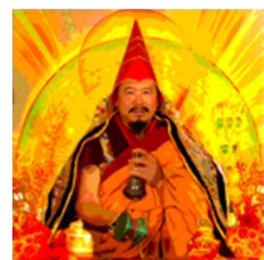
HH Dromtug Rinpoche